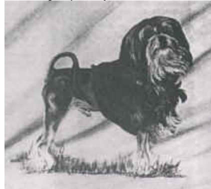
Cluneen Adam Adamant

Forequarters: Forelegs straight and fine boned. Shoulder well laid back.