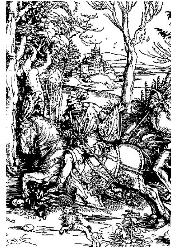
Albrecht Durer woodcutting mid-14 th century

Groomed and trimmed to resemble a lion in miniature, the Lowchen too symbolized leonine courage, though on a slightly lesser degree than the King of the Beasts. It is said that when knights were bold and got killed in battle, the custom was to decorate their tombs with a representation of a lion to commemorate their courage. If they survived a lifetime of skirmishes and succumbed to something less heroic like disease, old age or jealous husbands, their sarcophagi might bear the likeness of a Lowchen.