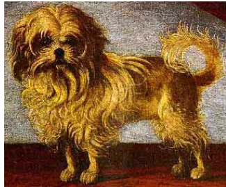
Study done for the portrait of Anna de' Medici Justus Sustermans, 1622 oil

The Lowchen breed can be traced back in history as far as the 1400's. Although the official country of origin is France, and there has been speculation that the Lowchen originates from the Mediterranean, we know that the breed has strong roots in both Germany and Holland since most of the breed's early evidence stems from these two countries.